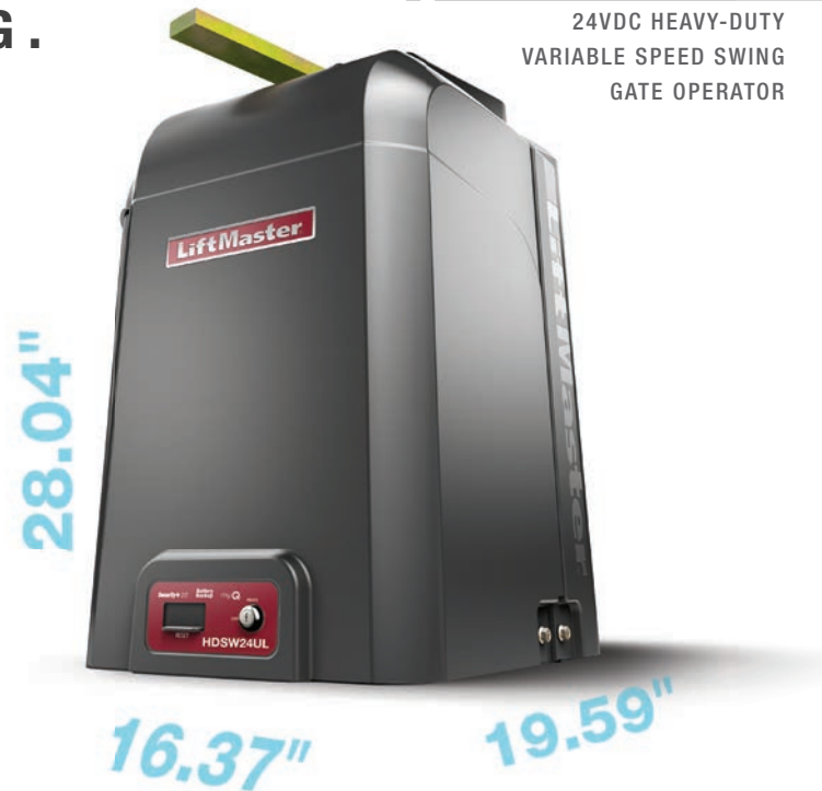
CAPACITIES STANDARD ARM