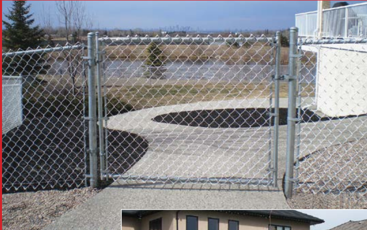
Galvanized Fence with Welded Gate