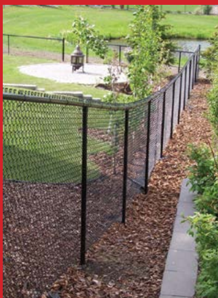
Full Color Black