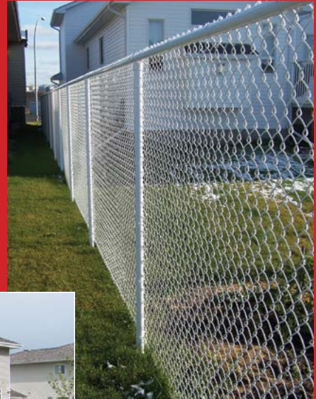
Full Color White