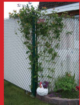
Full Color Green with White Slats