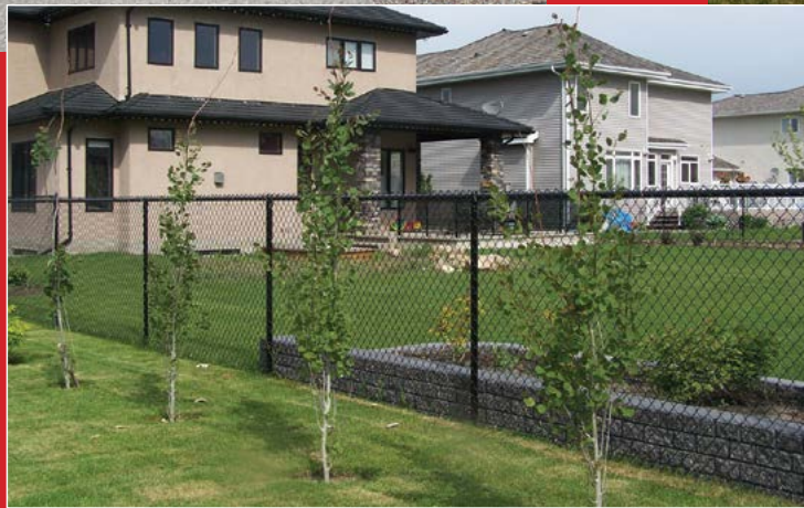
Full Color Black