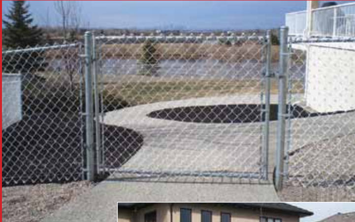
Galvanized Fence with Welded Gate