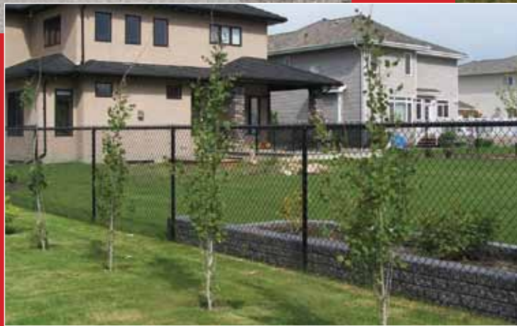
Full Color Black