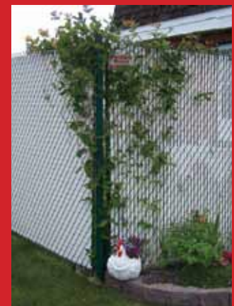
Full Color Green with White Slats