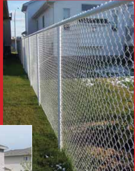
Full Color White