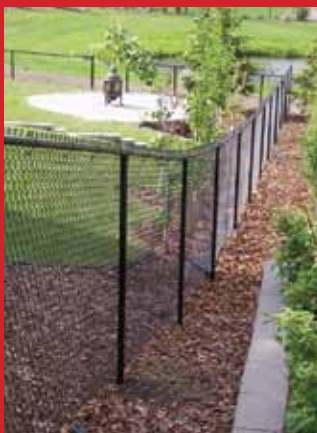
Full Color Black